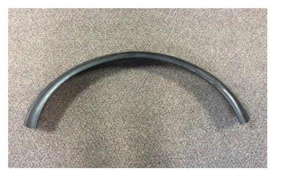
Long John Flare Driver's Side (1)